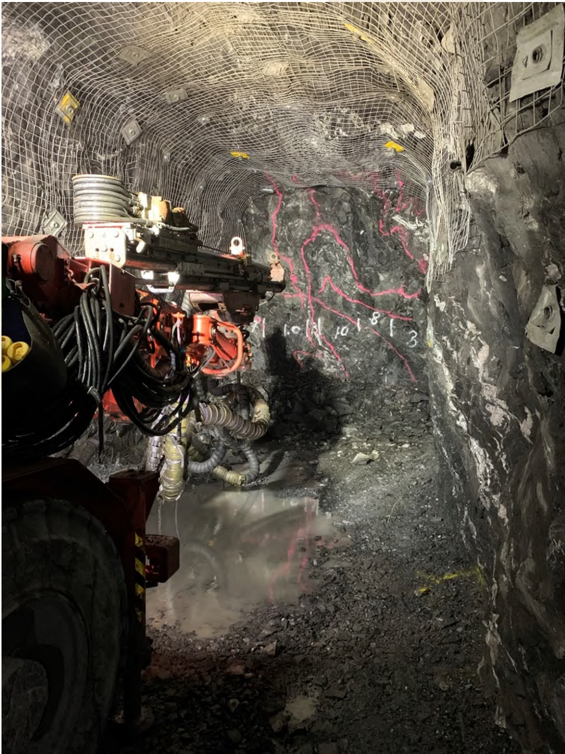
Ore drive underground at Golden Eagle

The Company is currently conducting work at both Makai and Riverina to assess the opportunity to add further underground production to our mine schedule. Makai is located adjacent to the historic Lights of Israel mine and less than 1km from the Davyhurst plant.