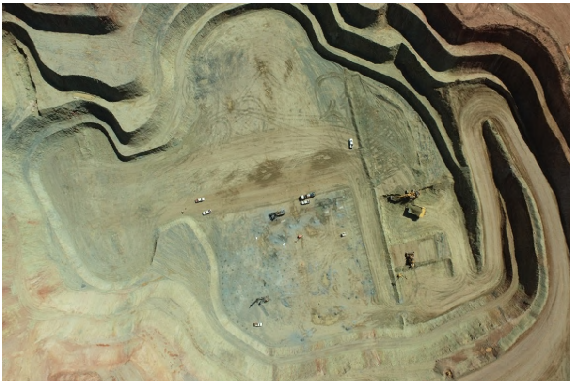
Riverina open pit (northern end).