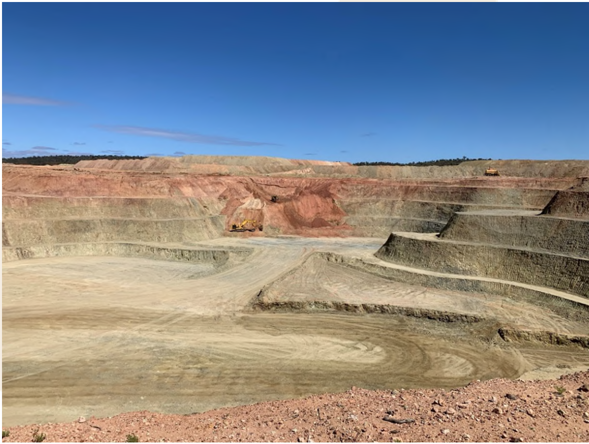
Riverina open pit (looking west) showing rehabilitation work of slip underway.